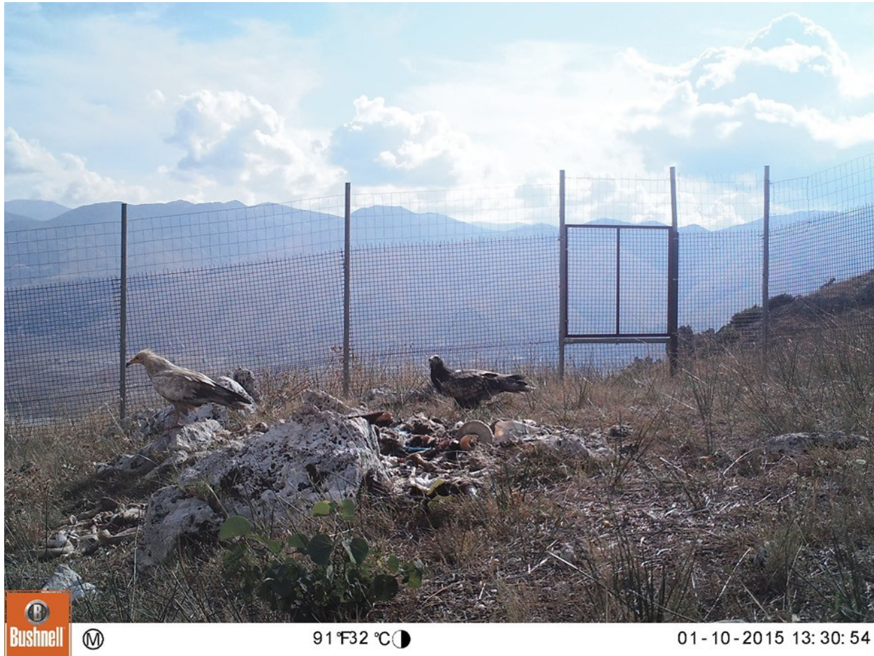
Photos of birds in the station